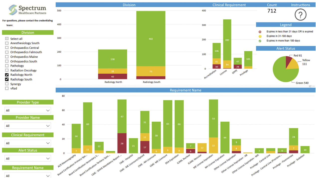
Fig 1. A real-time view of the dashboard as seen from the support staff perspective. This specific snapshot shows the results for all radiologists in the company. Results can be separated by division, requirement, alert status, provider, and requirement name. The legend in the top right corner demonstrates the time left until requirement expiration: red denotes less than 31 days or already expired, yellow denotes expiration in 31 to 180 days, and green denotes expiration in more than 180 days.